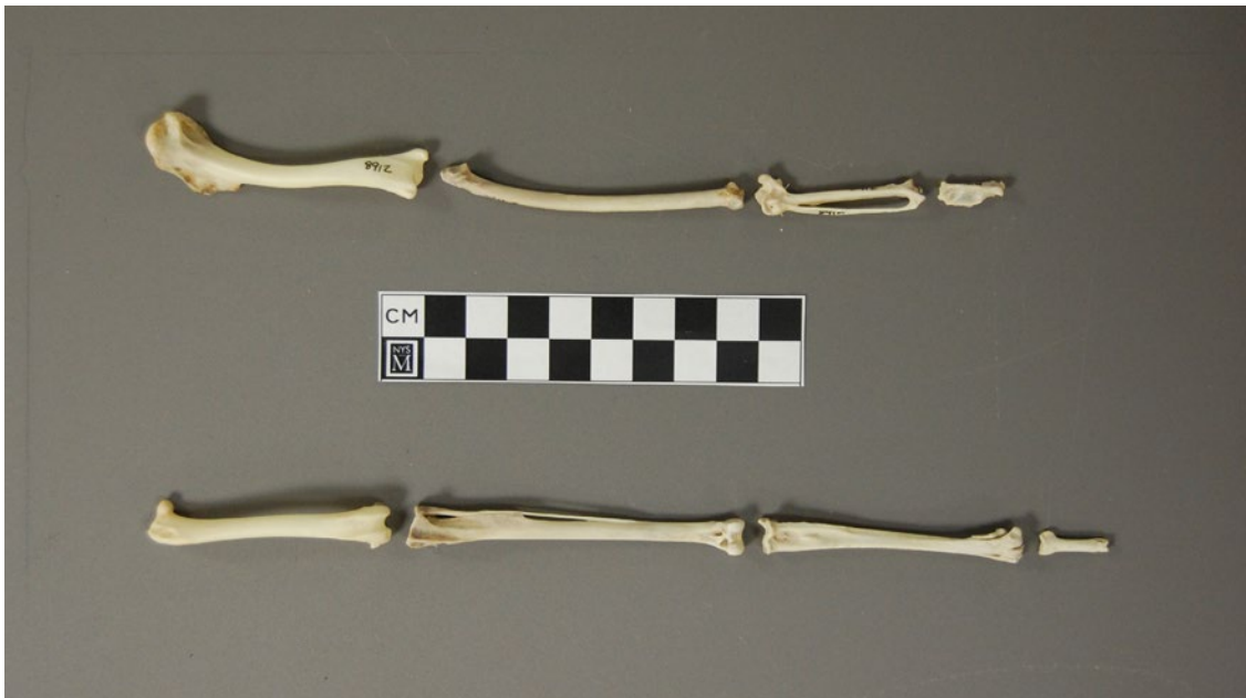
Cooper's Hawk, Accipiter cooperii , NYSM zo-8912.