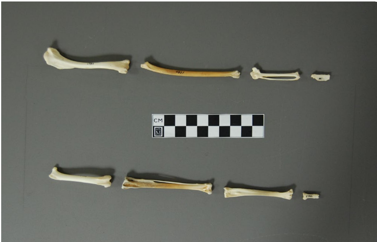
Broad-winged Hawk, Buteo platypterus , NYSM zo-1780.