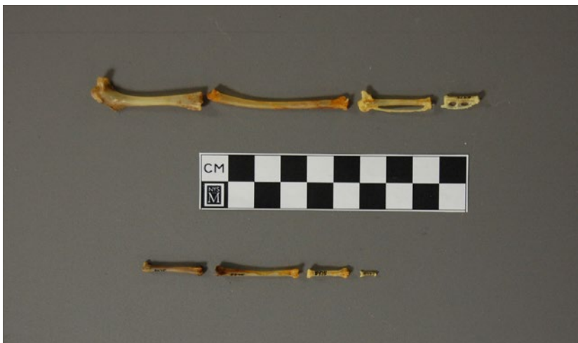
Common Nighthawk, Chordeiles minor , NYSM zo-8975.