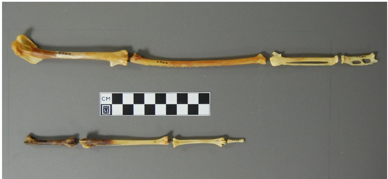
Caspian Tern, Hydroprogne caspia , NYSM zo-9964.