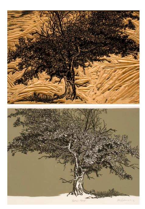
Untitled (Tree), 1972 Woodblock and woodcut print 12" x 19"