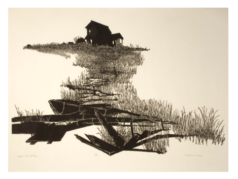
There Was a Time , 1967 Woodcut print 24" x 32"